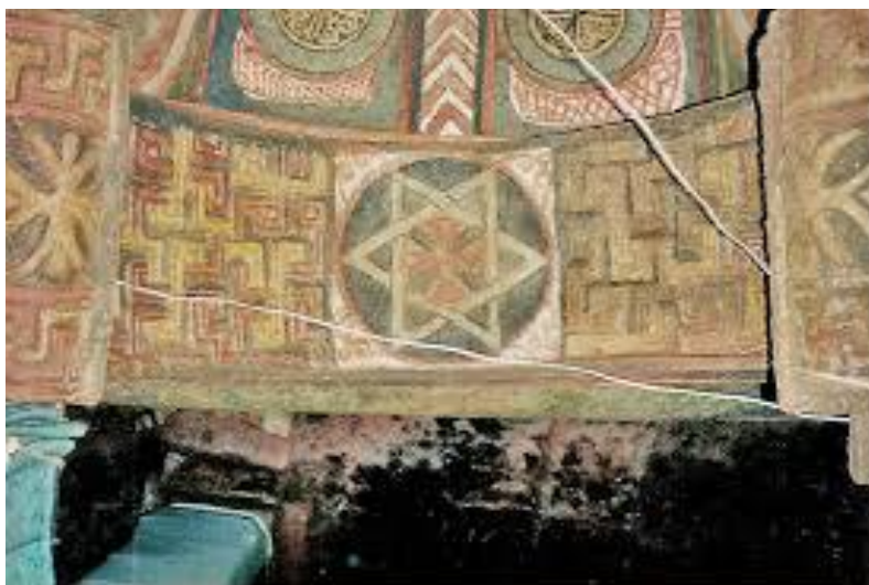
Seal of Solomon, Ethiopia, 12 th century