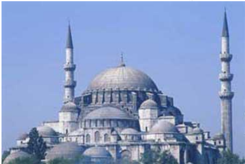
Conqueror's Mosque (Fatih Camii), Istanbul, former site of the Church of the Holy Apostles.