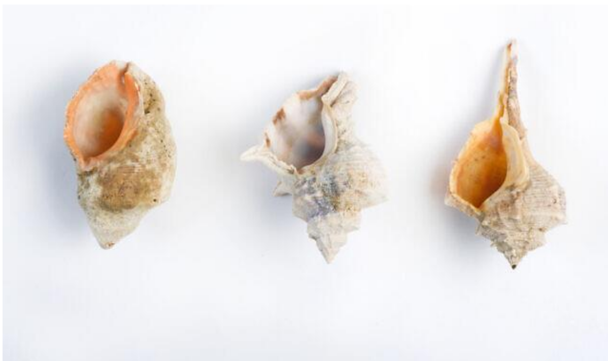
Species of murex found on Israeli coasts (right to left): Spiny Dye-Murex ( Murex brandaris); Banded Dye-Murex ( Murex trunculus), and Red-Mouthed Rock-shell ( Murex haemastoma)