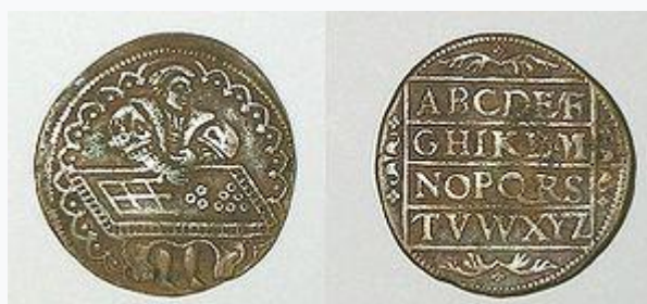
Jeton from Nuremberg, c. 1553