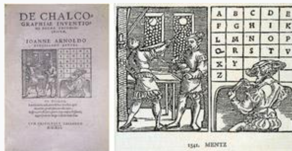
De chalcographiae inventione (1541, Mainz) with the 23 letters. J, U and W are missing.