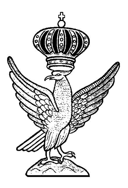
Order of the Holy Sepulchre